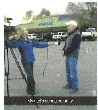
My dad's gonna be on tv

Let us know if you see any potential beaver issues in your 'hood!